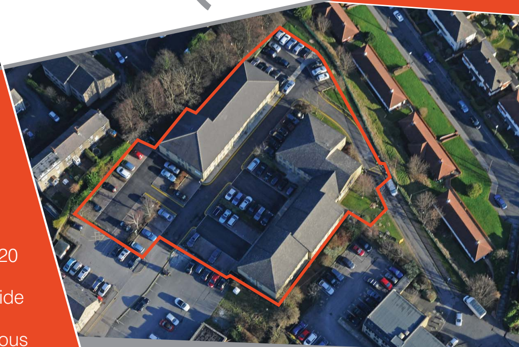
Feast Field • Horsforth • Leeds • LS18 4TJ

Horsforth is a busy area of Leeds positioned approximately 5 miles north west of Leeds City Centre and offers excellent communication links with both Leeds and Bradford via the A6120 outer ring road. Leeds Bradford Airport is only 2 miles away. A wide range of retail shops, banks, a Morrisons supermarket and various pubs, cafés and restaurants are all within a few minutes walk of Feast Field.